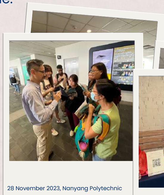
28 November 2023, Nanyang Polytechnic

On 28 November 2023, NAA concluded our final roadshow for the year at Nanyang Polytechnic Education & Career Fair. We shared details of our Bachelor of Science in Nursing with Honours (Top-up) degree programme with the nursing students. We also had an opportunity to speak to a few advanced diploma students who were keen to find out more about our Master of Science in Clinical Nursing programme.