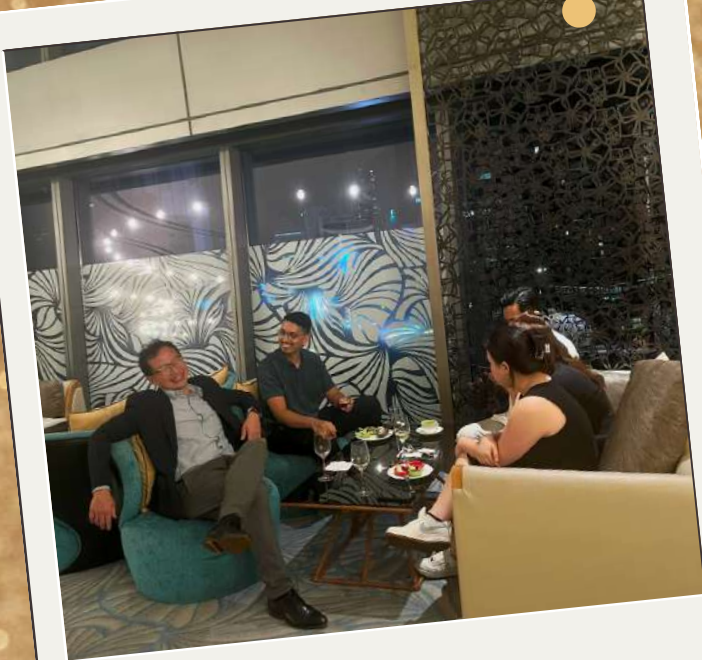
23 November 2023, King's x NAA Alumni Networking Reception

It was a glitzy affair at our very first networking reception for King's College London's alumni held on 23 November last year at Hotel Jen Orchardgateway. It was a memorable evening where we renewed old ties and made new connections. This event is held annually and we hope to see you in 2024!