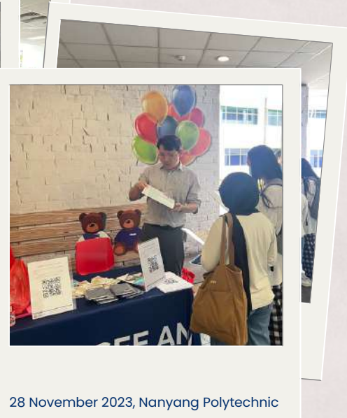
28 November 2023, Nanyang Polytechnic